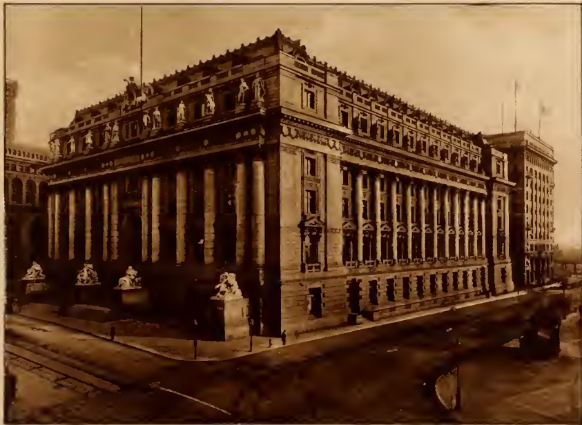
U. S. CUSTOM HOUSE is the home of the Revenue Officer and Collector of Customs.